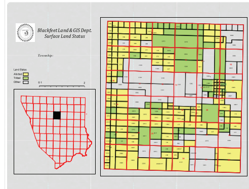
Chart 2 – Fractionated Blackfoot Indian Reservation Chart 3 – Fractionated Section Detail © 2015 Blackfoot Land and GIS Department